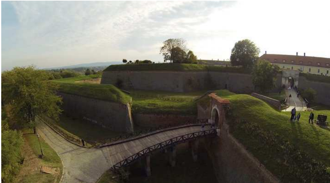
System of tunnels and underground, passages

A unique, scenic fortress built by the Habsburg empire in the 17 th century, situated on the Danube, overlooking Novi Sad.